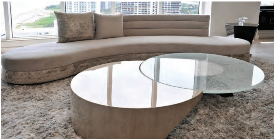
Today's Custom Design, Suite C-172 XL Sofa & Eclipse Table

Uniquely shaped extra large upholstered sofa and Eclipse style cocktail table with thick floating crackled glass top create the living room ambiance in a Palm Beach penthouse - custom designed and finished by Jaime Perczek.