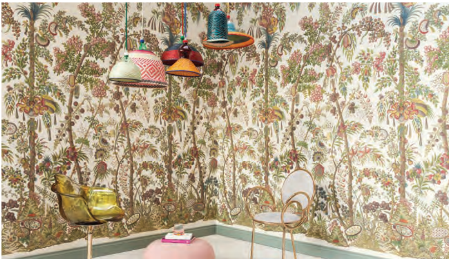
Pierre Frey, Suite B-101

The Imagine collection transports us to the colorful art world of the 1970's. Composed of geometric patterns and prints, jacquards, embroidery and weaves in colors that are deep and bright, inspired by the Supports-Surfaces art movement.