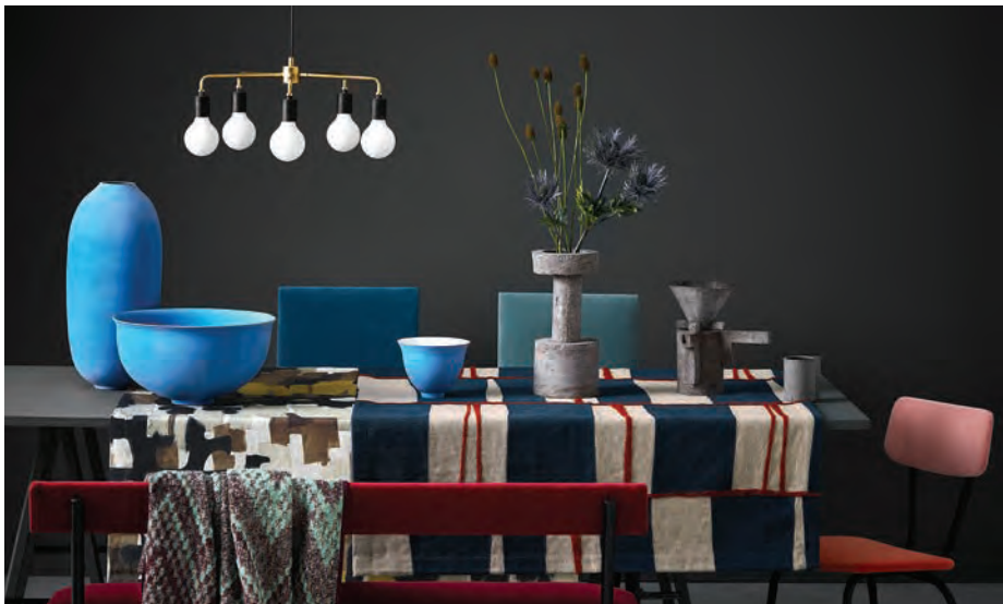
Pierre Frey, Suite B-101

The Imagine collection transports us to the colorful art world of the 1970's. Composed of geometric patterns and prints, jacquards, embroidery and weaves in colors that are deep and bright, inspired by the Supports-Surfaces art movement.