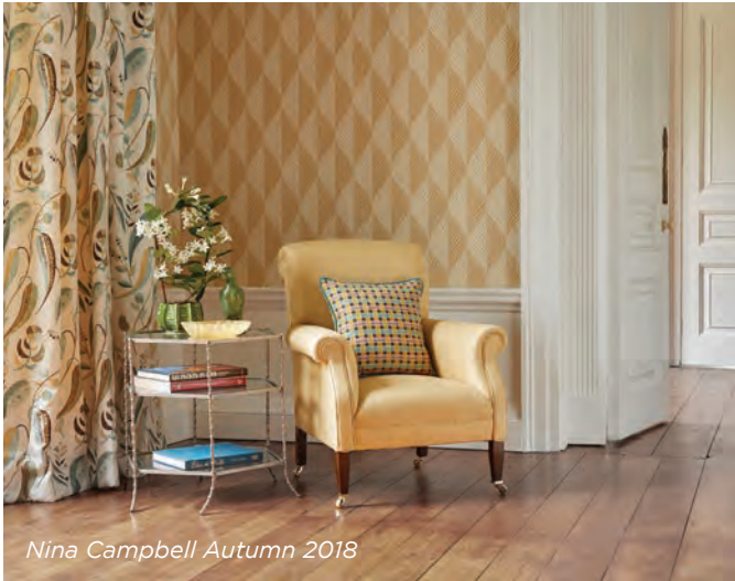
Nina Campbell Autumn 2018