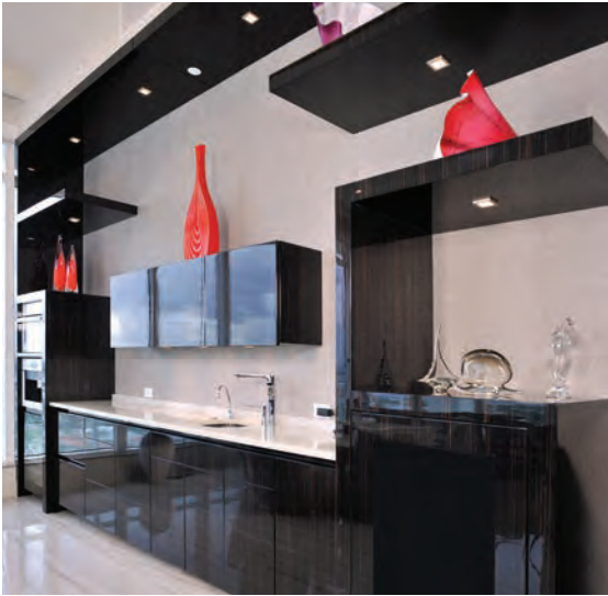
Today's Custom Design