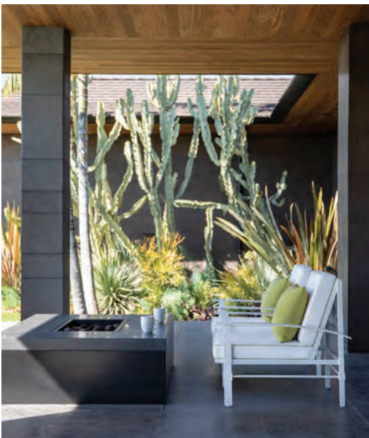
Sherle Wagner International, Suite C-166 Step Collection