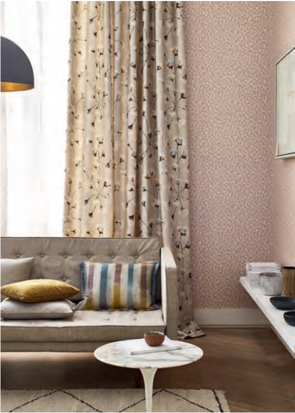
Cowtan & Tout