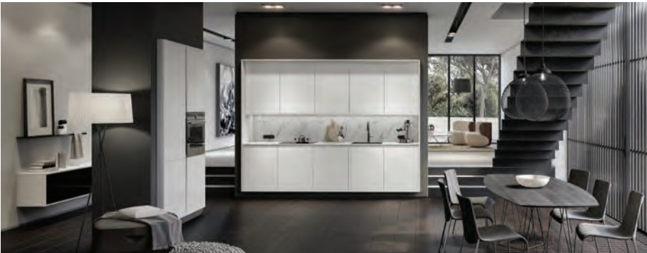
The Shade Store, Suite C-158 AERIN

The Frame Design for SieMatic's PURE lifestyle kitchen collection blends white, grey, and black hues with wood-grain finishes for a minimalist concept that emulates timelessly elegant comfort. The characteristic feature of the new handleless kitchen design is a delicate 2-centimeter frame that surrounds cabinets, side panels, and countertops, which creates clear boundaries with cubic forms while at the same time opening up a wide range of design and configuration options; kitchens in open floor plans appear as individual, sculptural design elements or like artwork integrated into the surrounding architecture.